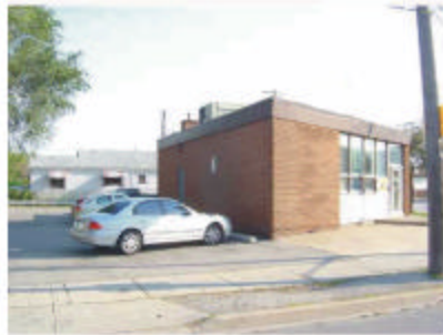
Easy expressway and bus access