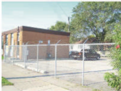
Large church parking lot